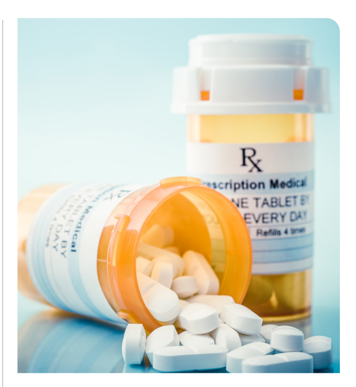
If you have AFib, your health care professional may prescribe medications to help prevent clots.