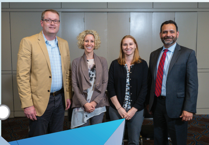
Vanderbilt University Center

“Other fellows and postdocs I’ve talked to outside the SFRN tell me they haven’t been as fortunate as I was as far as collaboration. But my takeaway from this SFRN is that teamwork is really important. I want to model my own research program based on what I experienced with the AHA.”