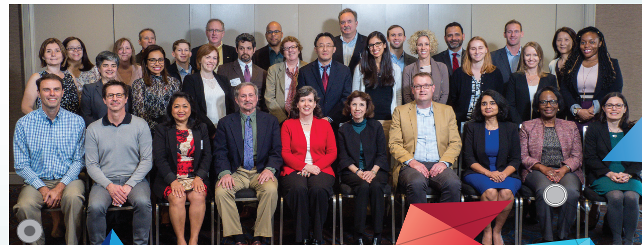
Obesity SFRN Awardees and Oversight Advisory Committee

"Our centers explored everything from genetic predispositions to maternal transmission of obesity to their offspring. As a result of all their hard work, I think we could eventually see new drugs and innovative new therapies that will help decrease obesity in patients. Indeed, we are extremely pleased that this SFRN initiated 10 additional clinical trials that will continue to produce translatable outcomes related to obesity. This is exactly the type of impact envisioned when the SFRN model was put in place."