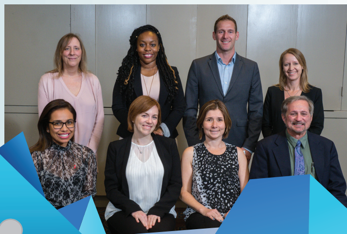
University of Alabama at Birmingham Center

"When it comes to obesity, we're in a brand-new day," he said. "And I think this SFRN is going to steamroll the way toward precision medicine and targeted therapies to reduce this burden of cardiovascular disease."