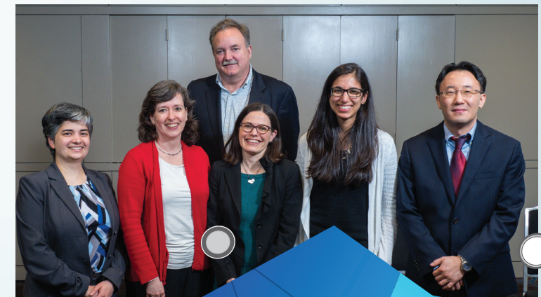
Johns Hopkins University Center

"I really love the fact that they were focused on diversifying their training and a diversity of thought," she said. "It really gave me an opportunity to also shine as a fellow."