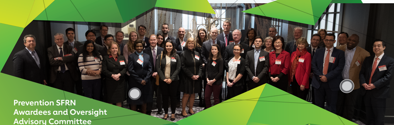
Prevention SFRN Awardees and Oversight Advisory Committee